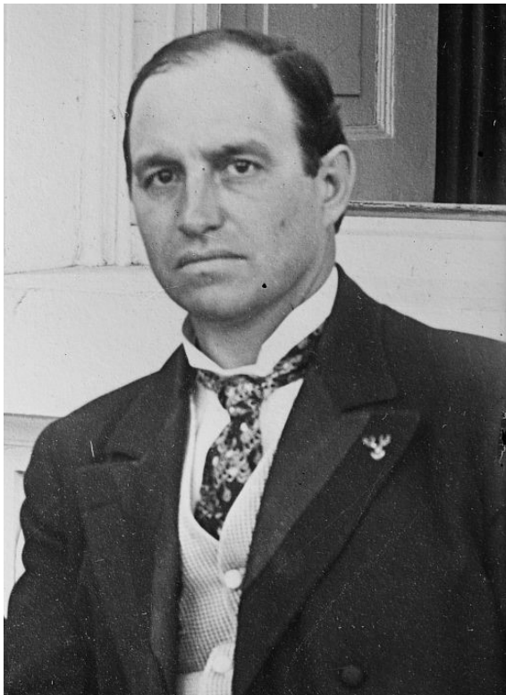
John Mitchell, President, United Mine Workers of America, 1901

In Pennsylvania mines, “wages were so low that parents were compelled to take their boys from school, sometimes when they were less than ten years of age, and put them to work in the breakers and the mines.”