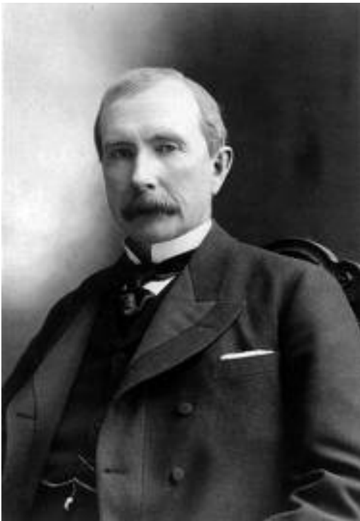
John D. Rockefeller (Business leader)

“I believe the power to make money is a gift of God ... to be developed and used to the best of our ability for the good of mankind. Having been endowed with the gift I possess, I believe it is my duty to make money and still more money and to use the money I make for the good of my fellow man according to the dictates of my conscience.”